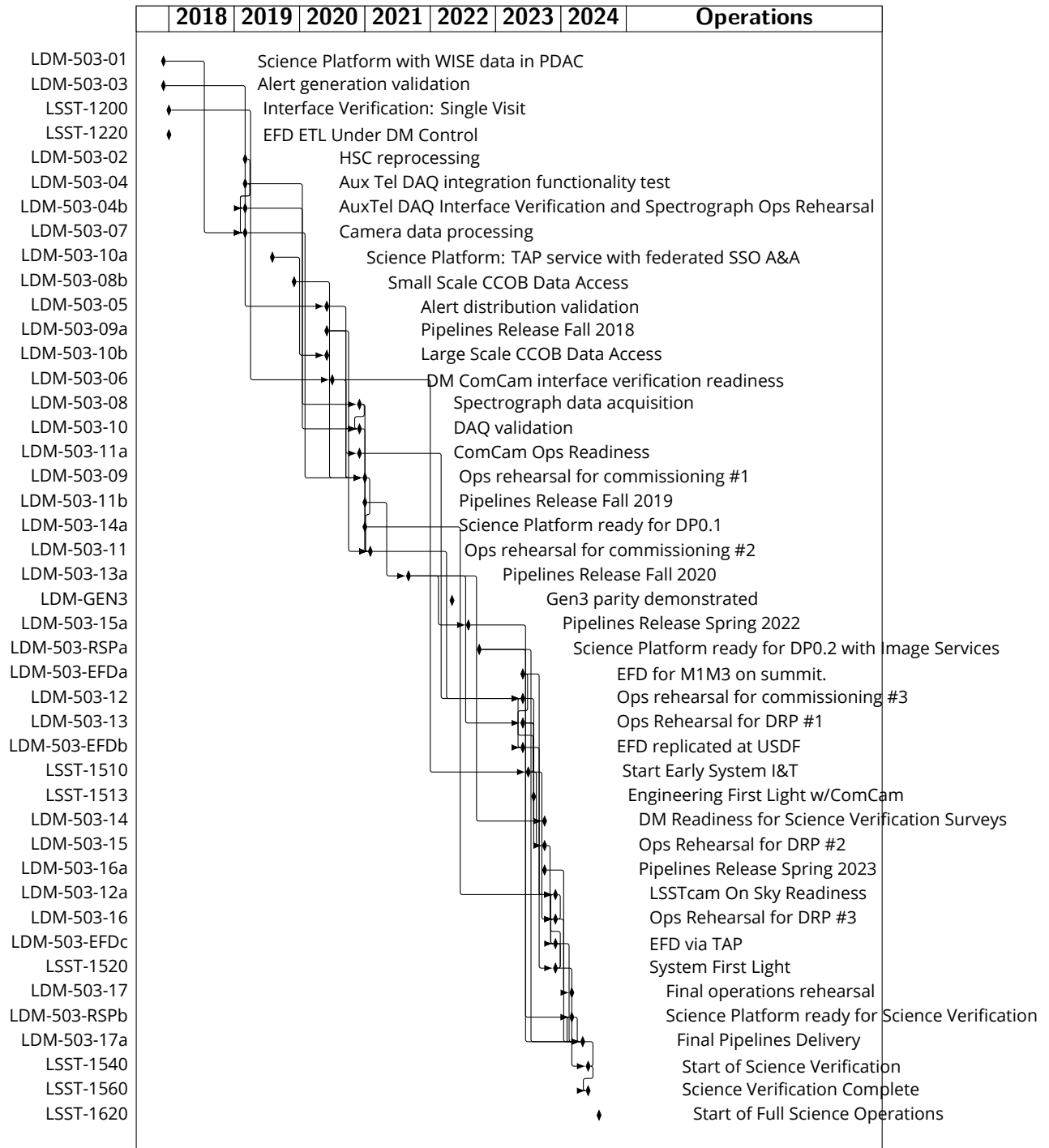
FIGURE 3: DM level 2 milestones (LDM-503-x) in the LSST rebaseline schedule.