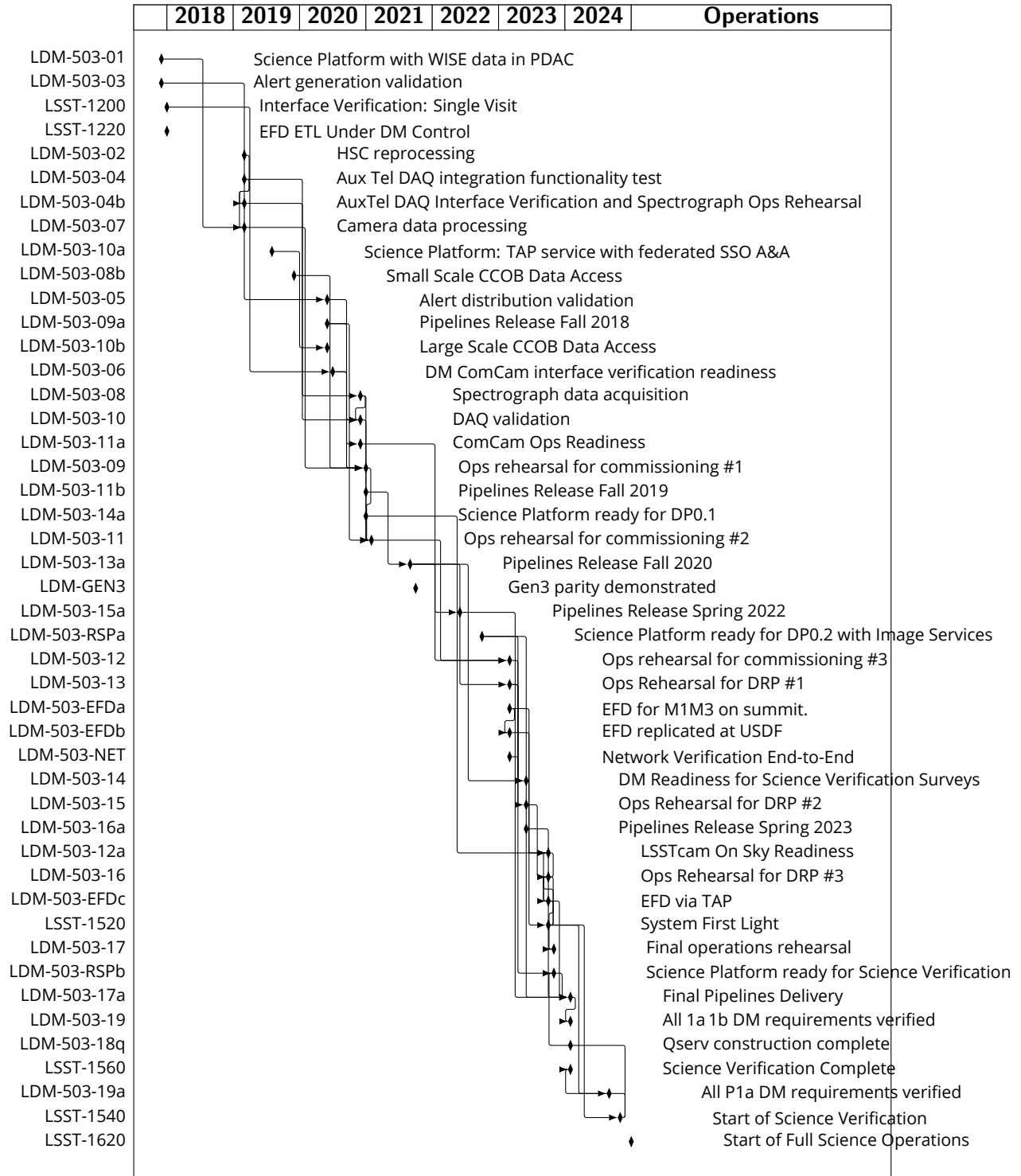
FIGURE 3: DM level 2 milestones (LDM-503-x) in the LSST rebaseline schedule.