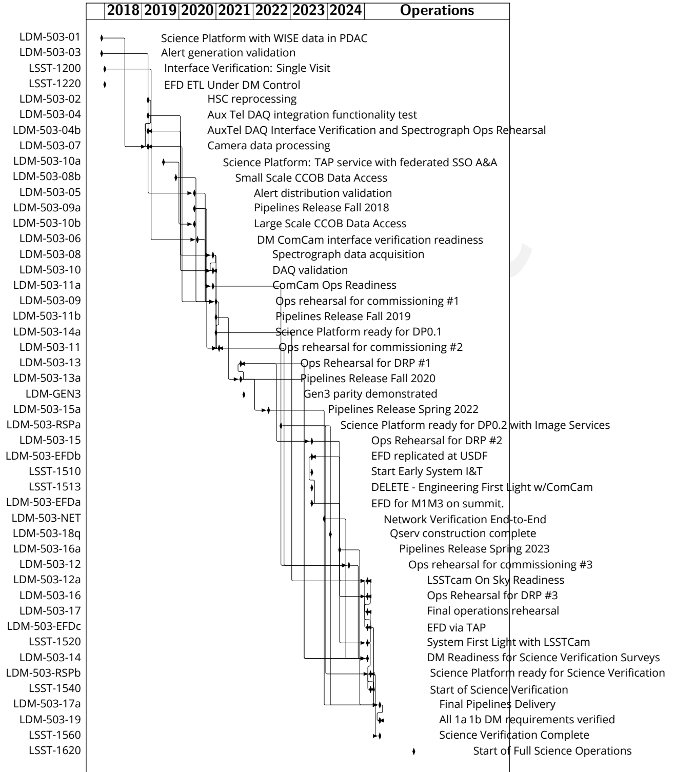
FIGURE 3: DM level 2 milestones (LDM-503-x) in the LSST rebaseline schedule.