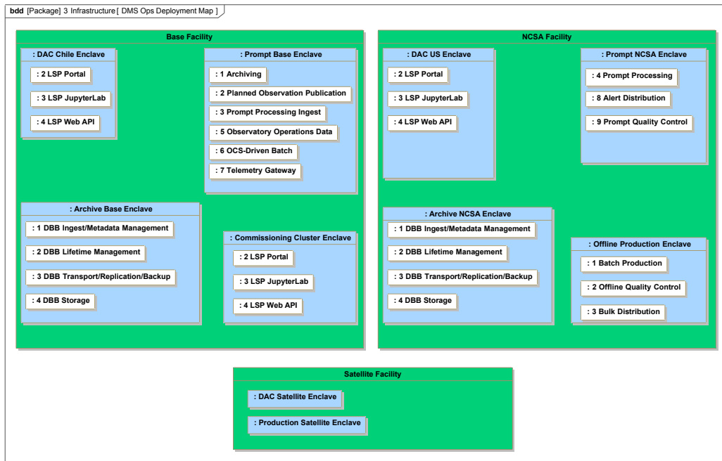
FIGURE 1: DM components as deployed during Operations. For details, refer to LDM-148.